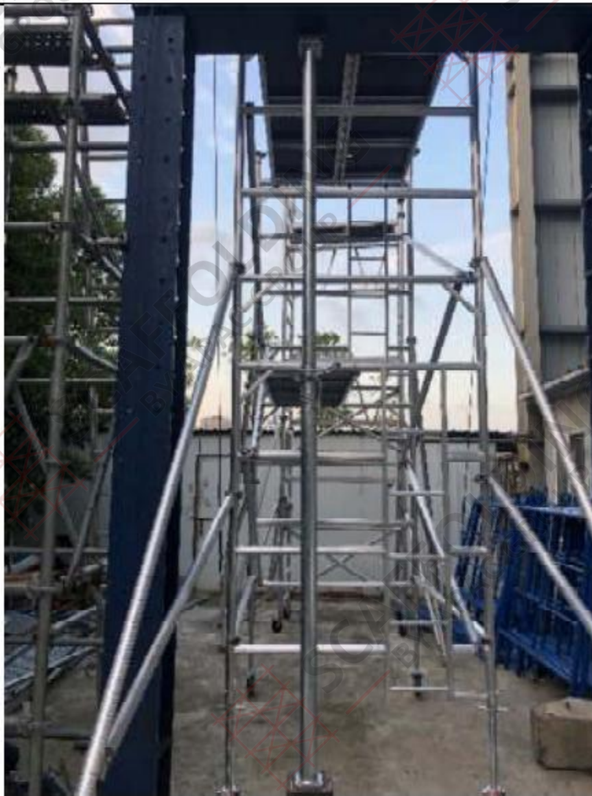
3 – In Test