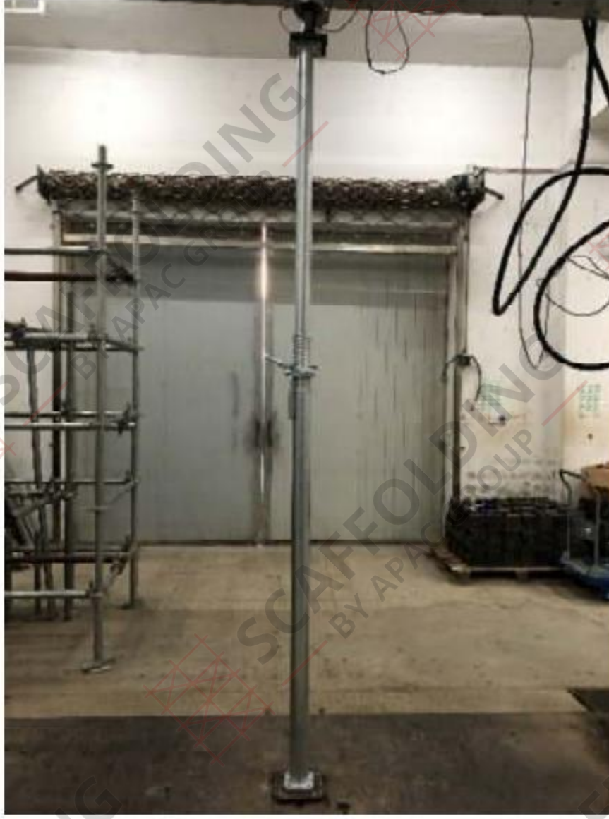
2 – In Test