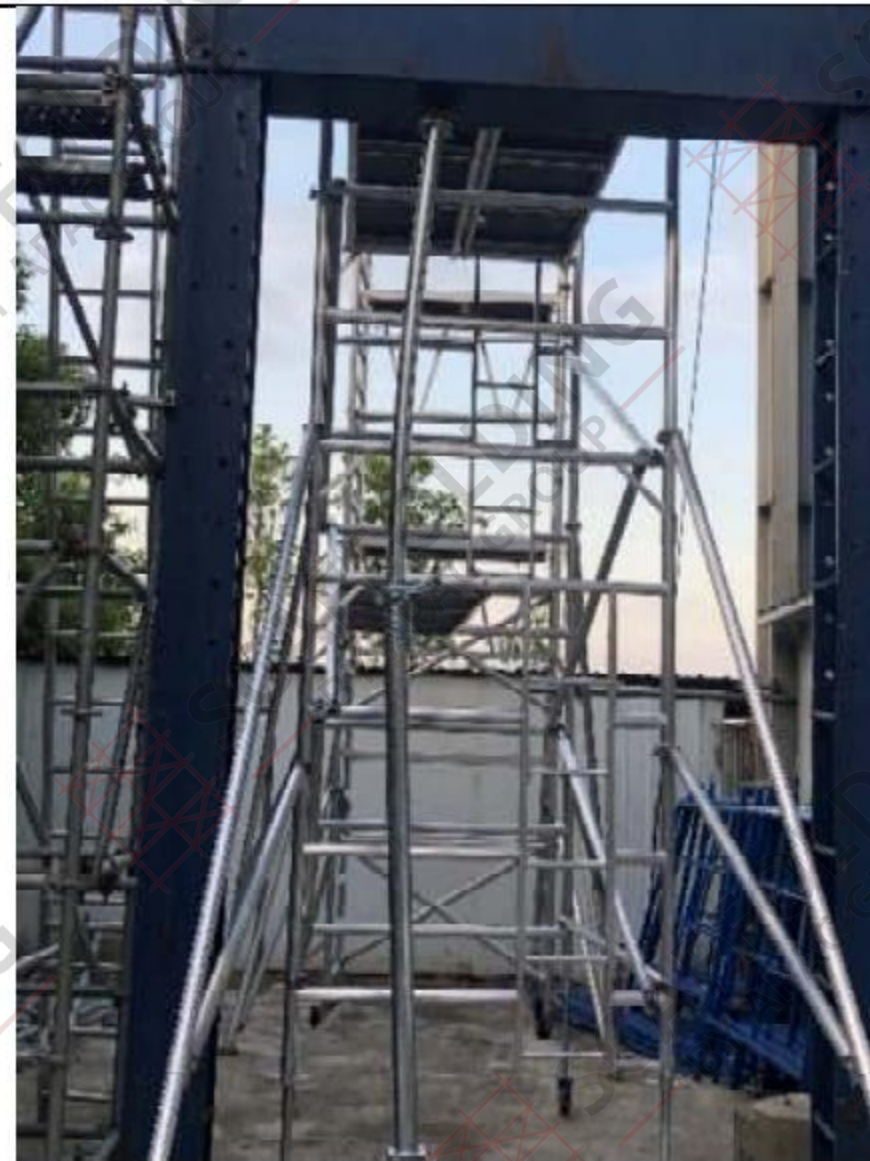
3 – After Test